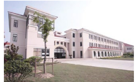
LES ROCHES JIN JIANG CHINA | SHANGHAI

As a world-famous luxury tourism resort, Marbella is a living classroom for hospitality students. Les Roches' Marbella campus offers a sun-kissed, hi-tech learning environment bursting with Mediterranean flair. The school's cutting-edge facilities simulate a modern hotel setting, while students also benefit from close contact with leading luxury resorts and international events.