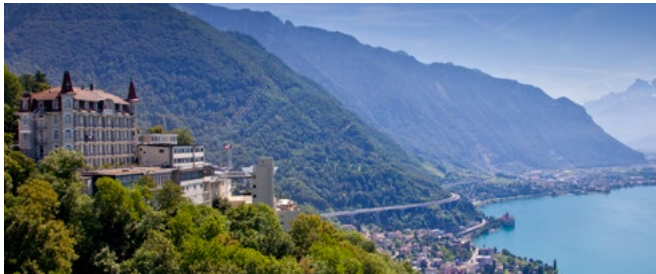
GLION SWITZERLAND | GLION & BULLE

Glion offers bachelor's and master's degrees in hospitality, luxury and event management to an international student body across three campuses in Switzerland and London, UK. With over 1,500 students from more than 90 countries, and an extensive network of industry contacts, the school offers exceptional preparation for international careers.