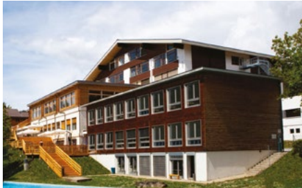
LES ROCHES SWITZERLAND | CRANS-MONTANA

Today, Les Roches offers a range of undergraduate and graduate degrees in the fields of hospitality, tourism and event management. These are taught on campuses in Switzerland, Spain and China. With study abroad options across its network of campuses, and more than 100 nationalities represented among its student body, Les Roches offers a truly global educational experience.