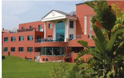
LES ROCHES SPAIN | MARBELLA

Nestled in the beautiful Swiss Alps, close to the world-famous ski resort of Crans-Montana, Les Roches' flagship campus blends tradition with innovation to provide a state-of-the-art center for hospitality education. Students benefit from a multicultural atmosphere, a vibrant campus life and facilities equipped with the latest digital technology.