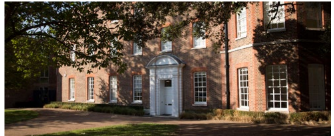
GLION UNITED KINGDOM | LONDON

Glion London offers the best of both worlds: a modern campus with ample green spaces and state-of-the-art facilities, which sits close to the heart of one of the world's most exciting capital cities. Situated in Downshire House, within the University of Roehampton, the campus offers a prestigious learning environment in elegant, historical buildings, plus superb accommodation and more.